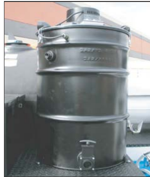
Optional Vacuum System with 50-Gallon Drum