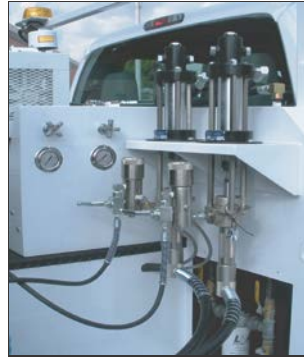
Up to six hydraulic-driven paint systems can be supplied