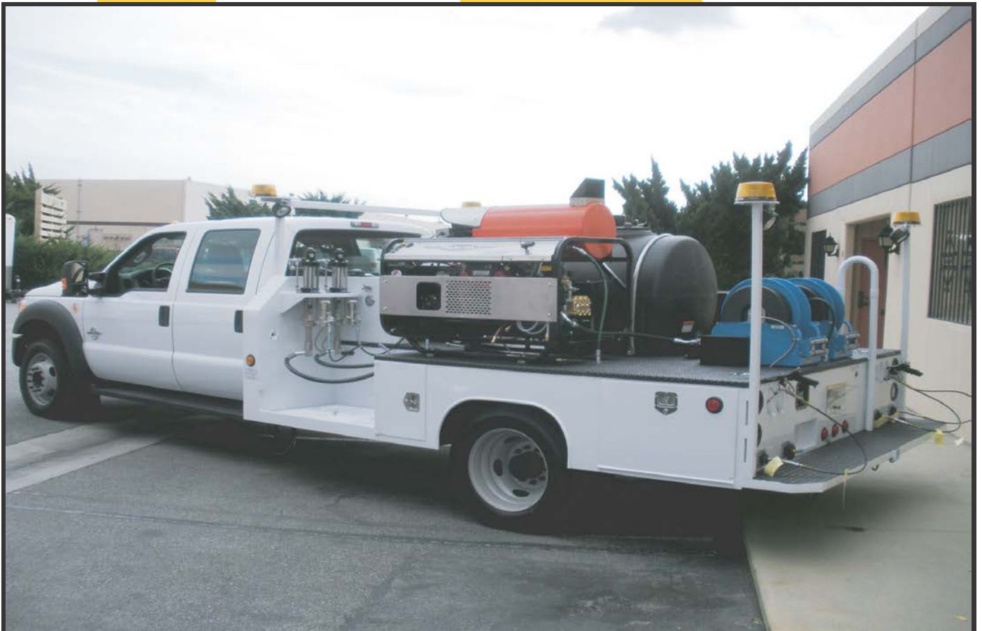
Model GPMT-H/W shown with various options