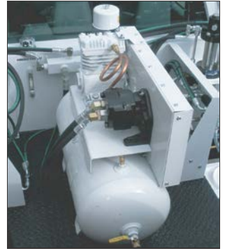
Optional Compressor System