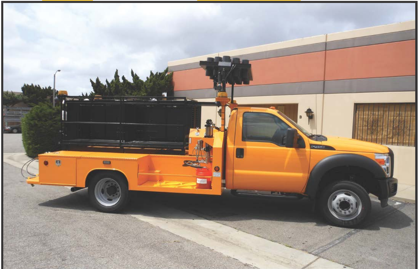
Model TPMT shown with various options.