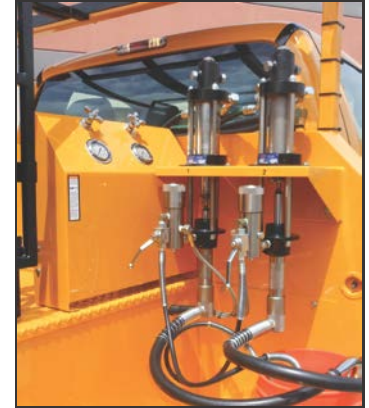
Multiple hydraulic-driven paint systems can be supplied. Easy access to hydraulic controls are standard.