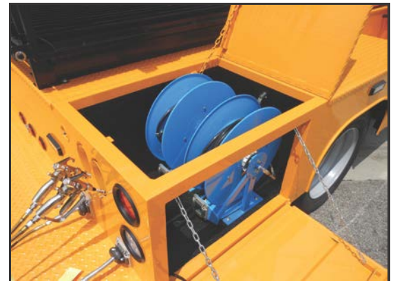
Hose reels mounted below deck with top and side doors for easy maintenance.